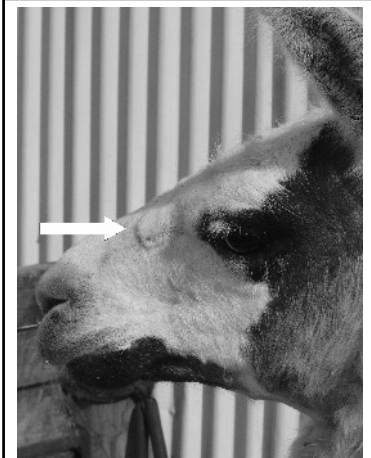
Usually located on the head, base of ears and feet.

Spread: By direct and indirect contact. Skin and hair that falls off while infected may remain viable for years attached to barn walls, fence posts, trees, feed dishes, halters and brushes.